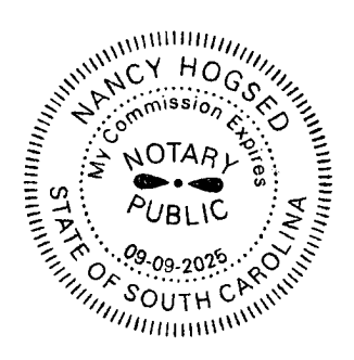
Notary Public for South Carolina My commission expires on: September 9<sup>th</sup>, 2025 This document was notarized in South Carolina

106 Henderson Crossing Plaza • Hendersonville, NC 28792 P. O. Box 490 • Hendersonville, NC 28793 828/692-0505 • FAX 828/692-2319 • 828/693-5581 www.blueridgenow.com