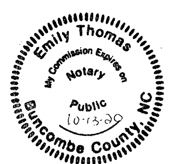
My Commission expires the 13th day of October, 2020

(828) 232-5830 | (828) 253-5092 FAX 14 O. HENRY AVE. | P.O. BOX 2090 | ASHEVILLE, NC 28802 | (800) 800-4204