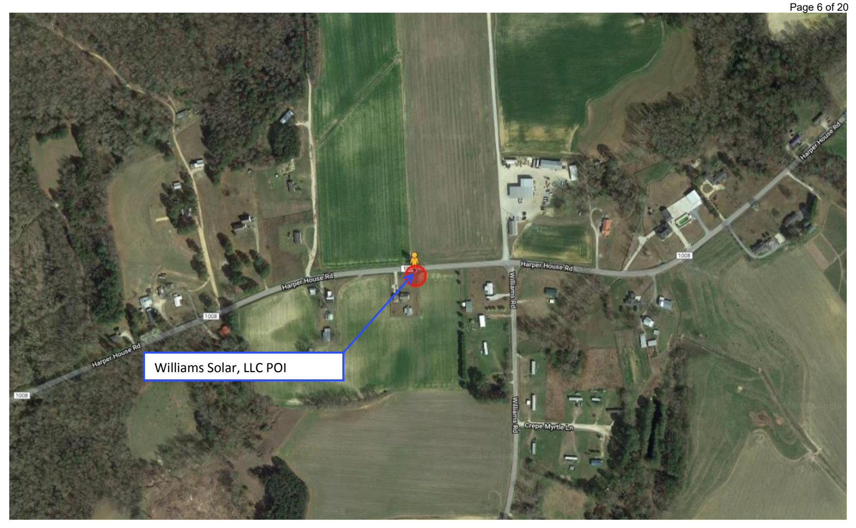
Figure 1 - Point Of Interconnection

Exhibit JB-2 Docket No. E-2, Sub 1220 Page 6 of 20